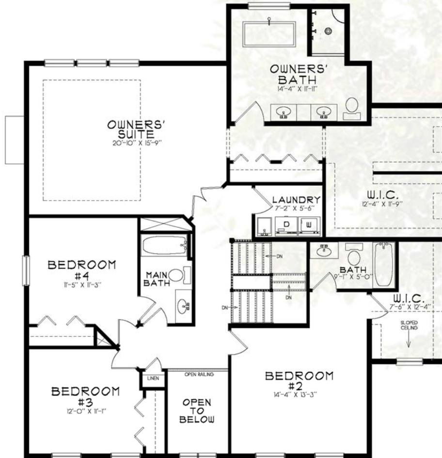
UPPER LEVEL PLAN